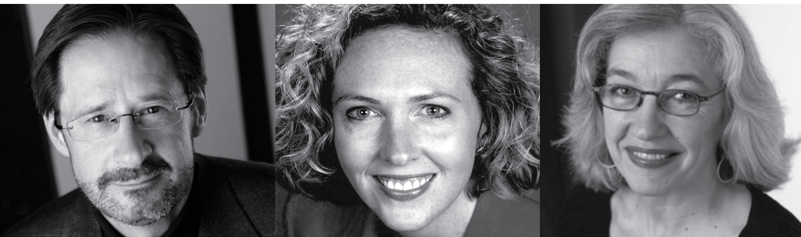
Steven Stucky Chair