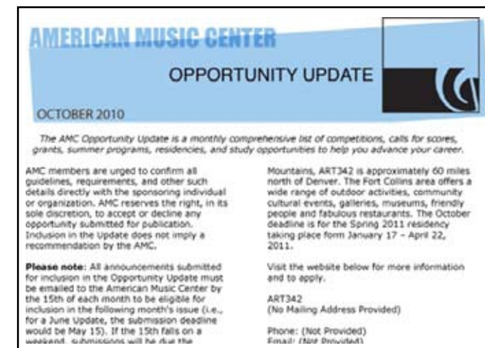
The October 2010 Opportunity Update listing, available online in Members-Only

The Center's 2,500 members hail from all 50 states and 25 countries, and include composers, conductors, performers, ensembles, commissioners, academic and performance institutions, industry professionals, and advocates.